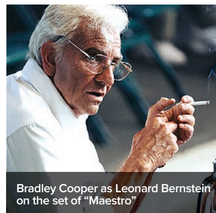
Bradley Cooper as Leonard Bernstein on the set of “Maestro”

“Sticking your neck out, hoping to get to tell the stories you love and