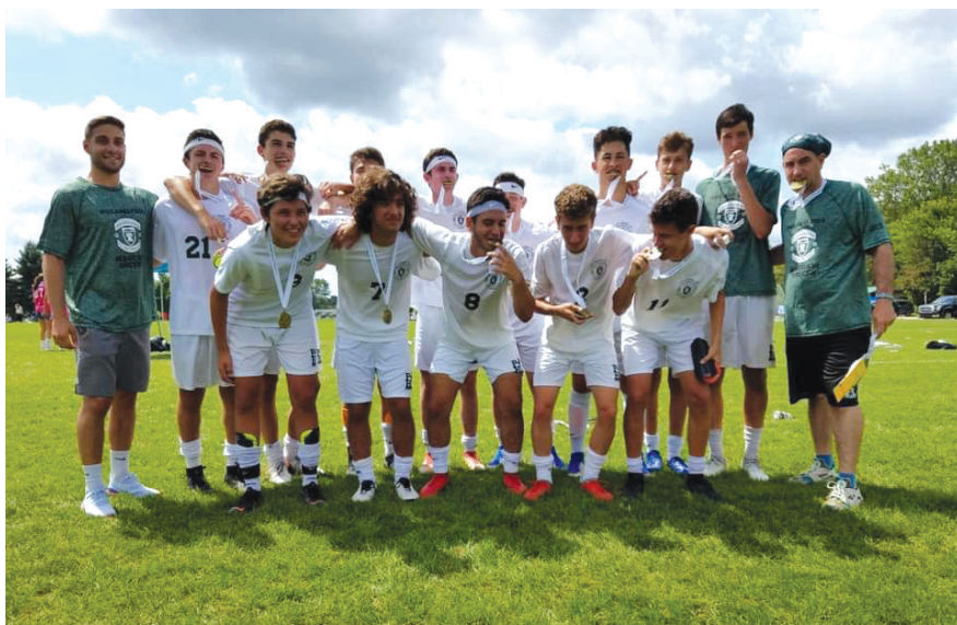
A boys soccer team from the Philadelphia delegation at a recent JCC Maccabi Games

The inaugural class is going to include two or three times as many athletes, teams and contributors as a normal class will in the future.