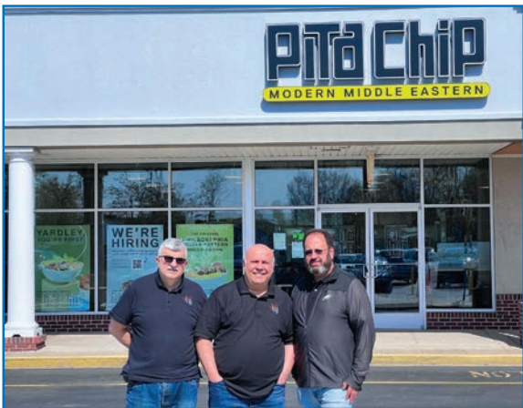
8 Restaurant’s expansion shows interfaith solidarity.