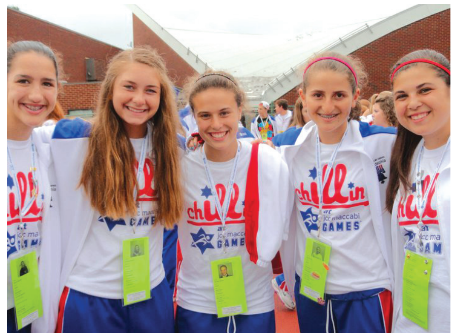
Female athletes from Team Philadelphia at the JCC Maccabi Games