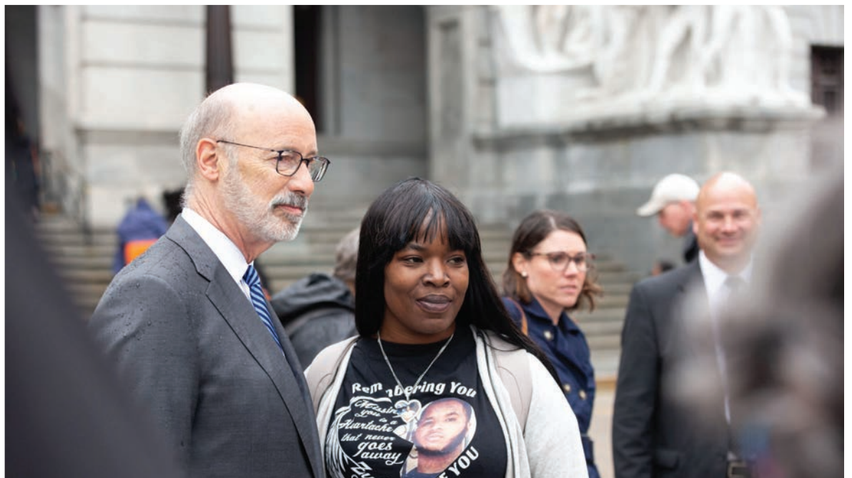
Pennsylvania Gov. Tom Wolf (left) at the Uvalde to PA End Gun Violence Rally on May 27