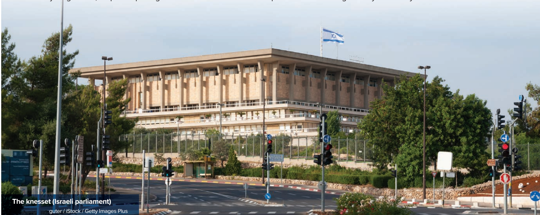
The kneset (Israeli parliament)