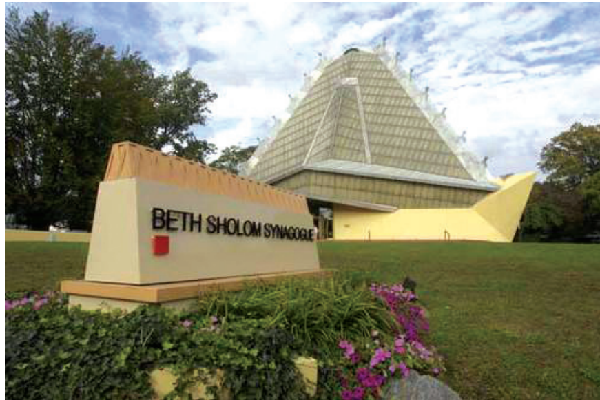
Beth Sholom Congregation was founded in 1918, but it is known for its Frank Lloyd Wright-designed building erected in 1959.