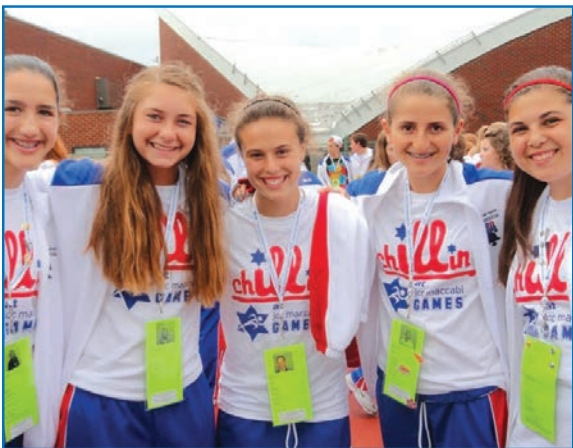
6 Kaiserman JCC plans to open a Maccabi Hall of Fame.