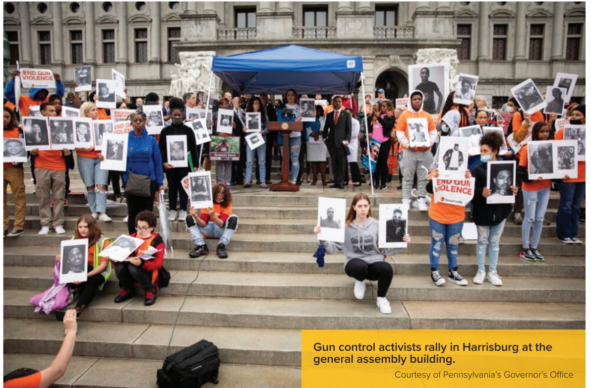
Gun control activists rally in Harrisburg at the general assembly building.