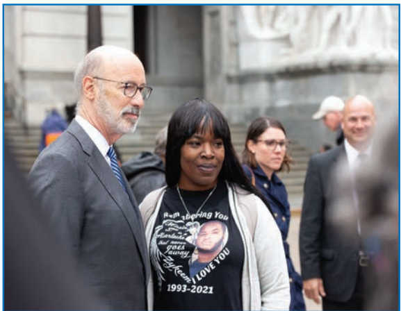
20 Jewish leaders tackle the complications of gun violence.