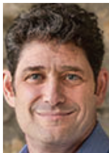
BY RABBI SHAI CHERRY